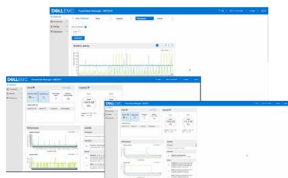
Simple, intuitive management with scripting support

PowerVault ME5 is supported through a wide range of management interfaces starting with PowerVault Manager, the element manager for each PowerVault storage array. This simple to use and intuitive web-based management